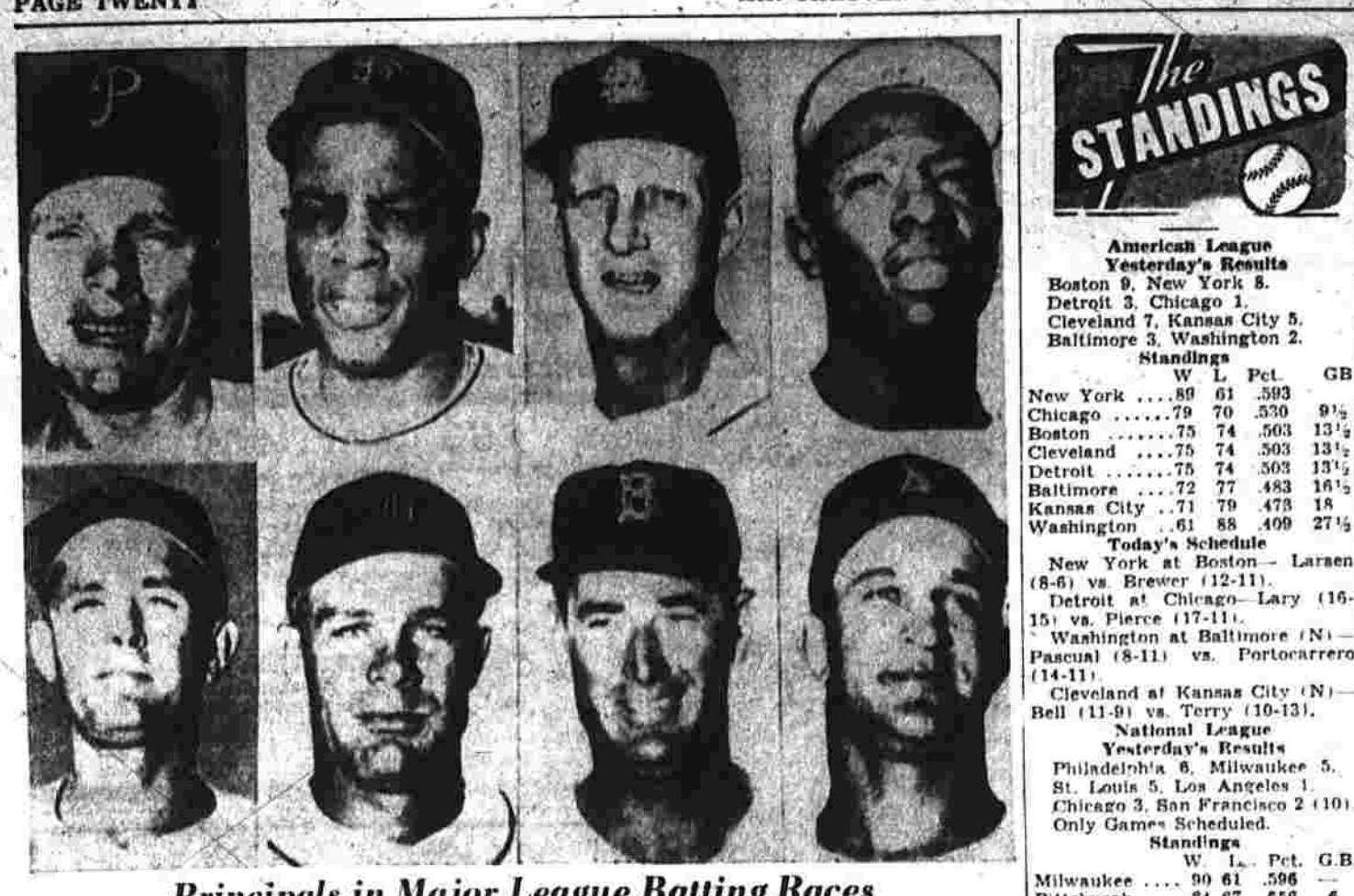
Principals in Major League Batting Races